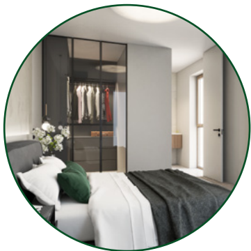
BEDROOM WITH A DRESSING ROOM AND BATHROOM