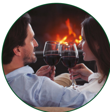
COZY LIVING ROOM WITH A FIREPLACE