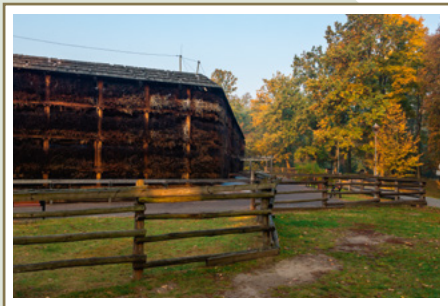
ZDROJOWY (SPA) PARK